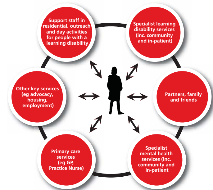
Support available to people with a learning disability and mental health needs

If a person has concerns about their health they will usually access primary care services, which include health centres and general practitioner (GP) surgeries. These services assess and treat 'common mental health problems' including mild depression and anxiety disorders and also have a role in monitoring more complex or ongoing mental health problems. Primary care services are also the gateway to specialist and